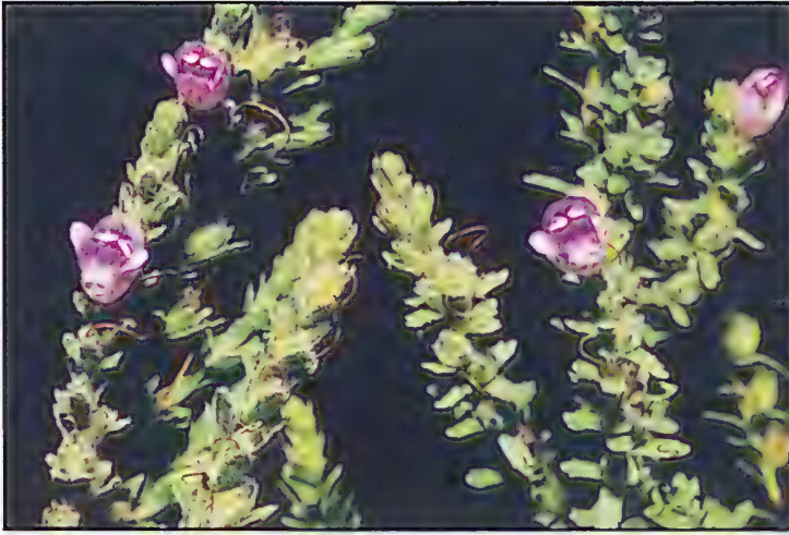
Figure 2. Eremophila koobabiensis (cultivated, ex Chinnock 9540)

Conservation status. The species is listed as Declared Rare Flora (Threatened) under the Western Australian Wildlife Conservation Act 1950 and it is currently considered critically endangered.